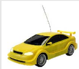
Cartronic Opel Astra scale model