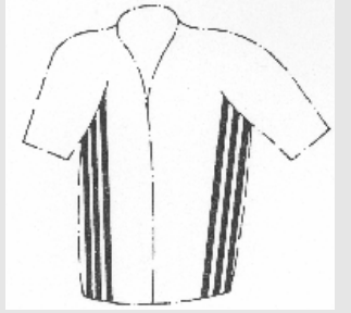
Int. Reg. 414034